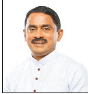
Hon.ble Shri. Prashant Thakur (Member of Legislative Assembly Panvel)